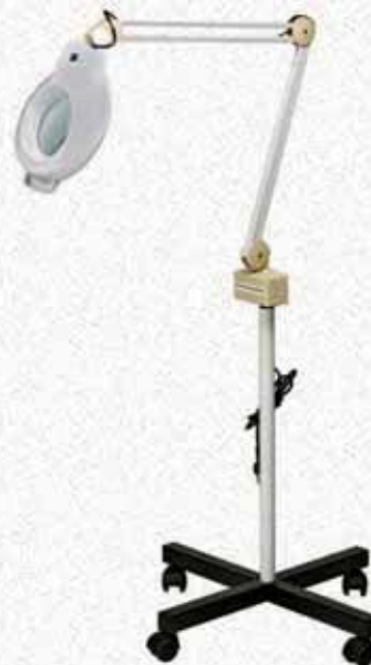
MODEL: 1054 MAGNIFYING LAMP