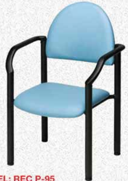
MODEL: REC P-95