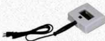
MODEL: KT-1013 Woods lamp For proper skin inspection