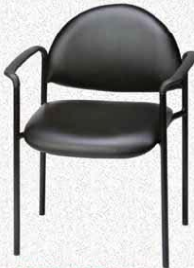
MODEL: REC W-600