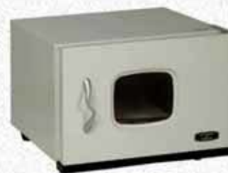
MODEL: KT-1036 With sterilizer Holds up to 24 towels 11½"H x 18"W x 13"D"