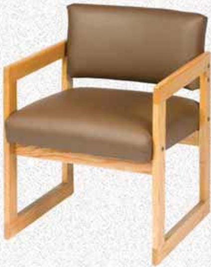
MODEL: REC P-20