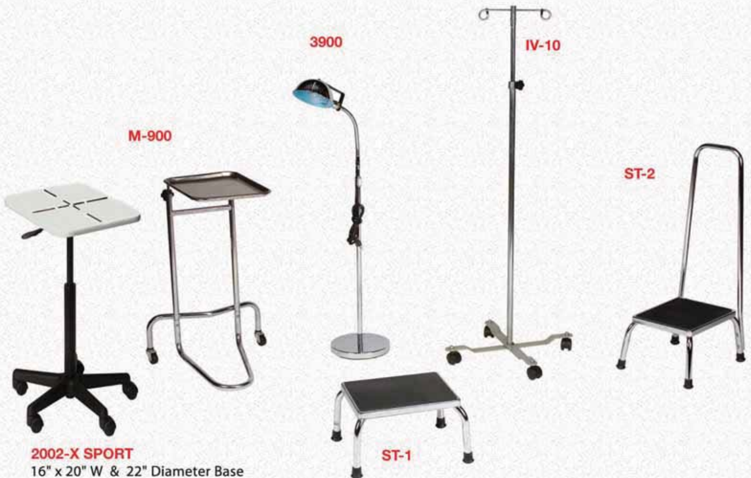
2002-X SPORT 16" x 20" W & 22" Diameter Base

M-900 Mayo table with Stainless Steel Tray (12 1/2" x 19") Adjustable height from 32" to 52"H