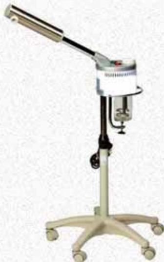
MODEL: KT-1000 FACIAL STEAMER