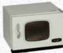
MODEL: KT-1016 Small hot cabinet Holds up to 12 towels 9½"H x 13"W x 11"D"